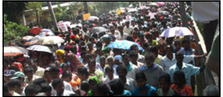
A picture of a huge protest held by Tamil residents of Jaffna calling on the LTTE to release the civilians held back by them in Puthukudiruppu area as a human shield. - Courtesy — Daily Mirror - 31 January 2009

We, the New Zealand Society for Peace, Unity and Human Rights in Sri Lanka wish to tell our Tamil brethren that we